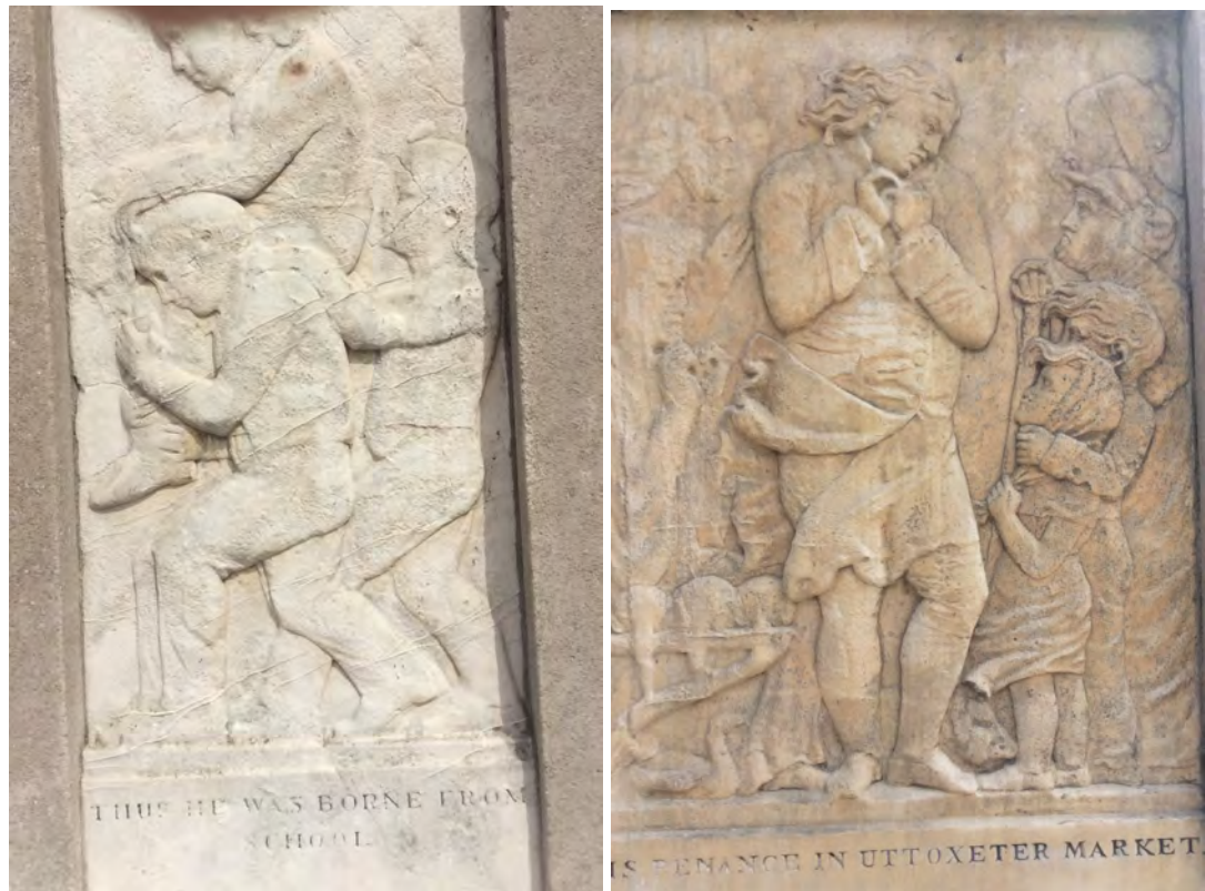
Figure 2: Side-panel scenes beneath statue of Johnson by Richard Cockle Lucas

Johnson's life had, therefore, already been 'monumentalised', to use Hart's description, in a manner akin to the Gospel narrative. 77 In Boswell's Life of Johnson , Carlyle in fact argued that, 'as the highest Gospel was a Biography, so is the life of a very good man still an indubitable Gospel'. 78 Reducing Johnson's life to a few exemplary performances was to make them stand out in relief; the part standing for the whole. Each, however, represented a