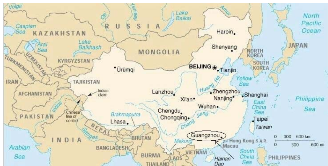
Figure 1.1 location of Guangzhou

Guangdong is a big province in south China with a population of 91,940,000.(2005 projection from China Ministry of Health). Guangzhou is the provincial capital of Guangdong province. (Figure 1.1) It is a city of more than 10 million population. The birth rate and the death rate in Guangzhou are 9.56‰ and 5.74‰ respectively in 2004, which are slightly lower than the national level. Guangzhou is the leading economic and cultural city in southern China.