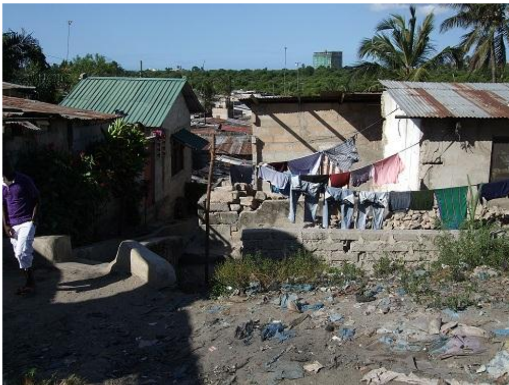
Figure 1 – The area of Kinondoni Hanna Nasifu

approximately 4 km north from the city centre, Hanna Nasifu is overlooked by new apartments built next to Muhimbili hospital. Hanna Nasifu has a population of approximately 20,000 (Sheuya 2007, 445) and borders the uzunguzi area of Upanaga and the planned neighbourhood of Kinondoni. Located in a dip close to the Msimbazi creek, it is subject to occasional flooding. In May 1991 the area was subject to heavy flooding due to which 72 houses collapsed (Nguluma 2003, 36).