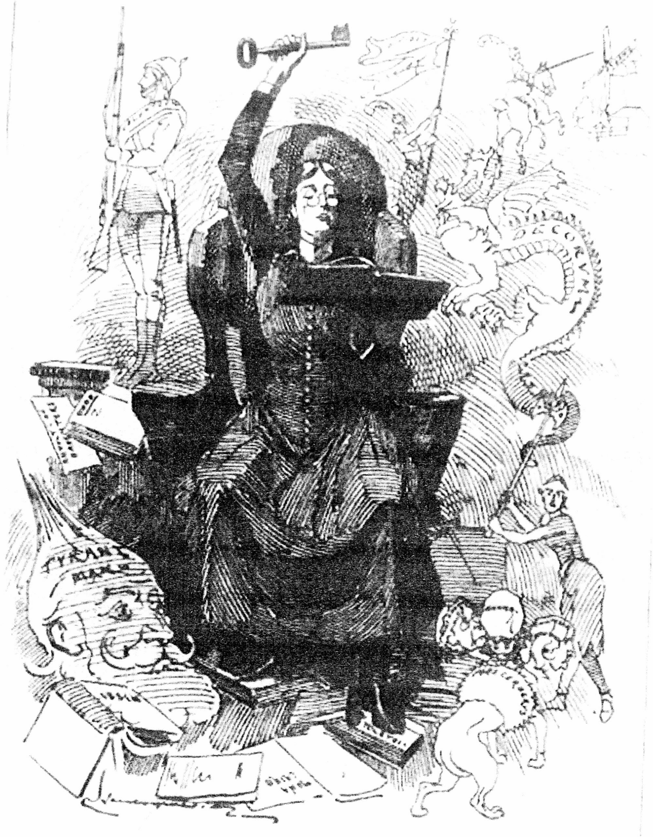
13. Donna Quixote.