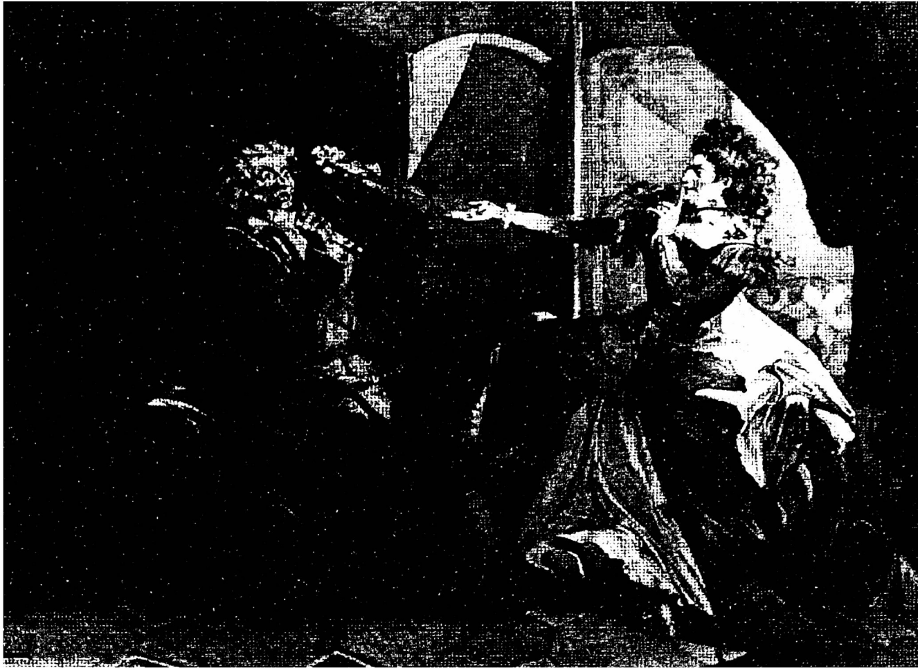
3. Hannah Pritchard and David Garrick in the dagger scene.