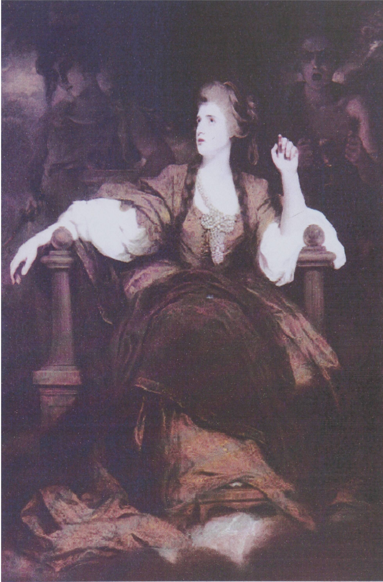
1. Sarah Siddons as the Tragic Muse