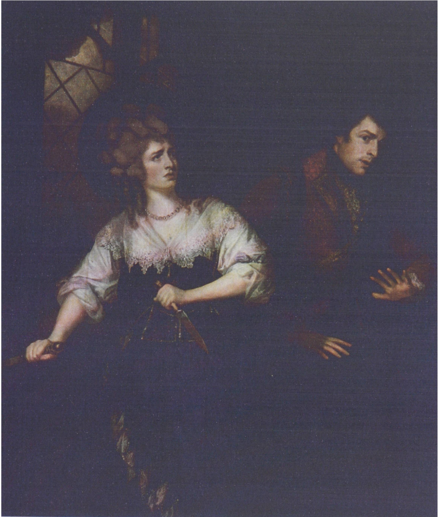
11. Sarah Siddons and John Philip Kemble in “Macbeth”.