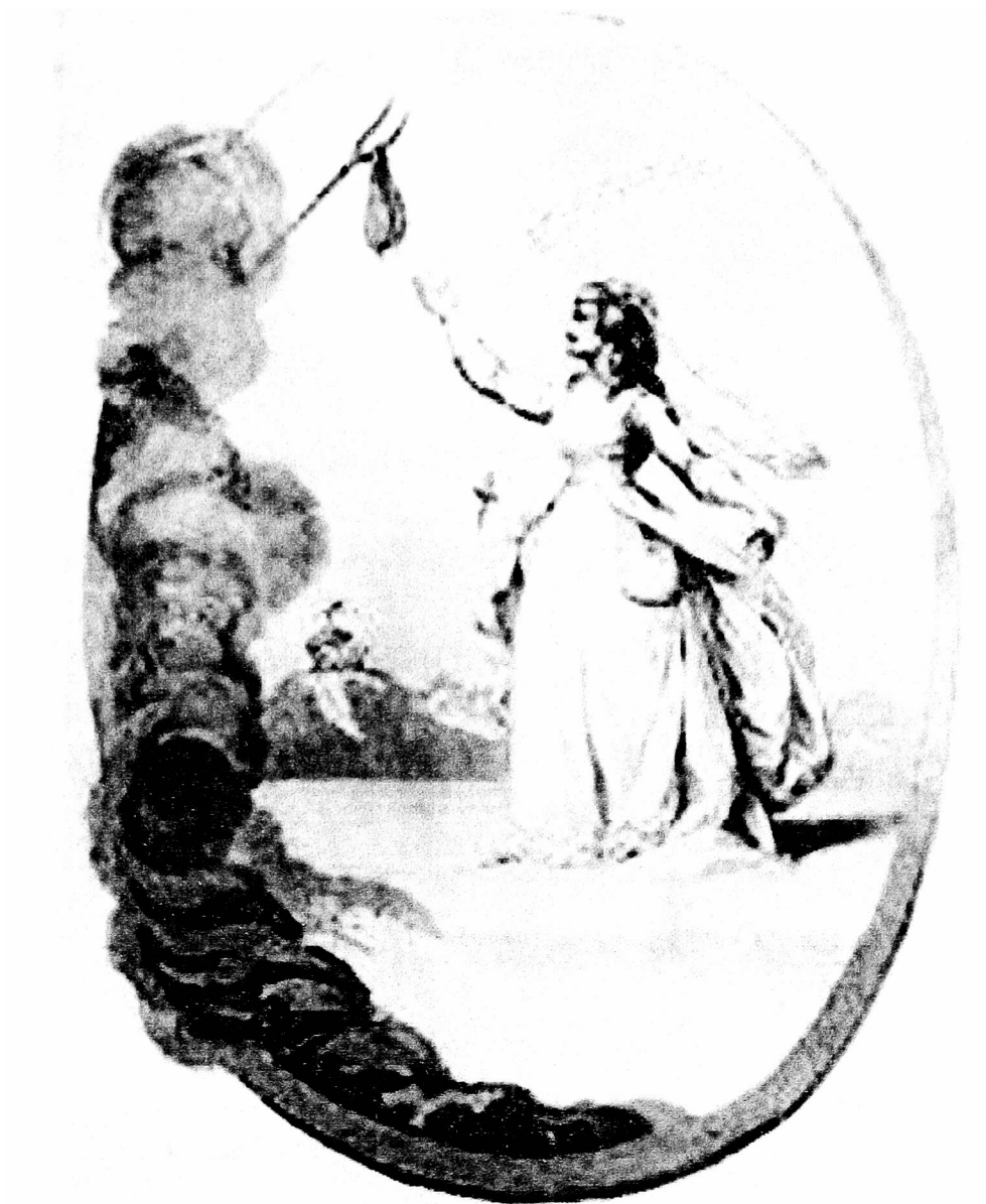
4. Melpomene (Mrs Siddons).