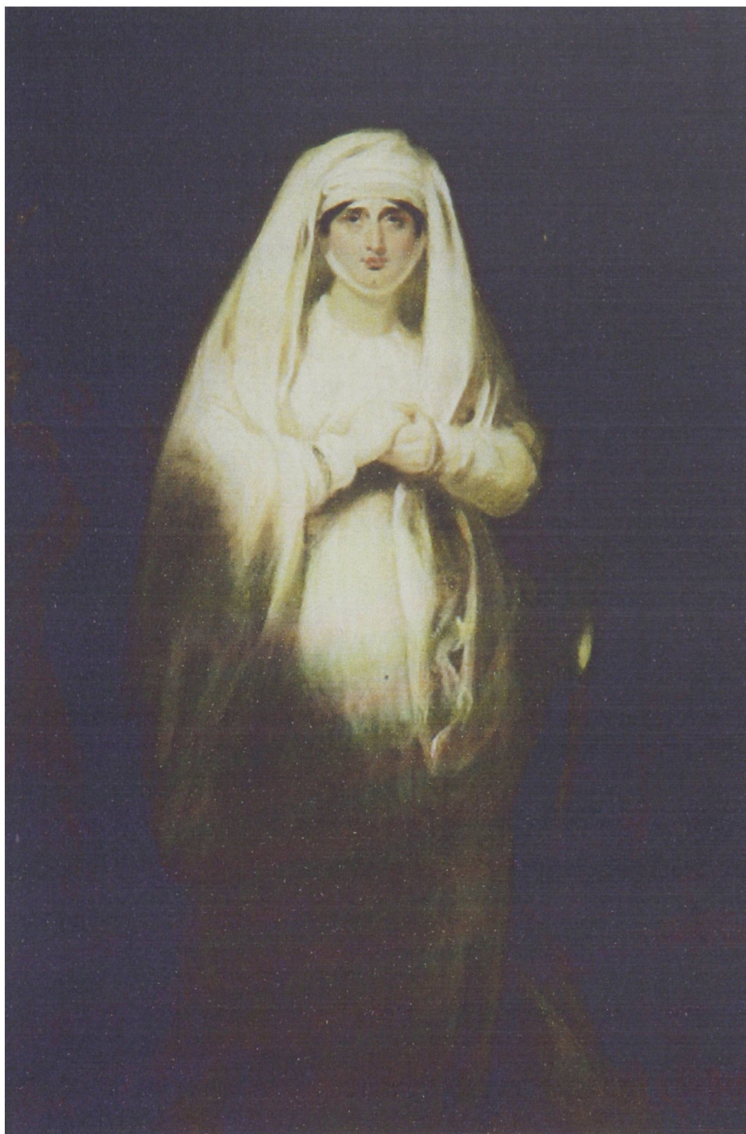
9. Sarah Siddons as Lady Macbeth in the sleepwalking scene.