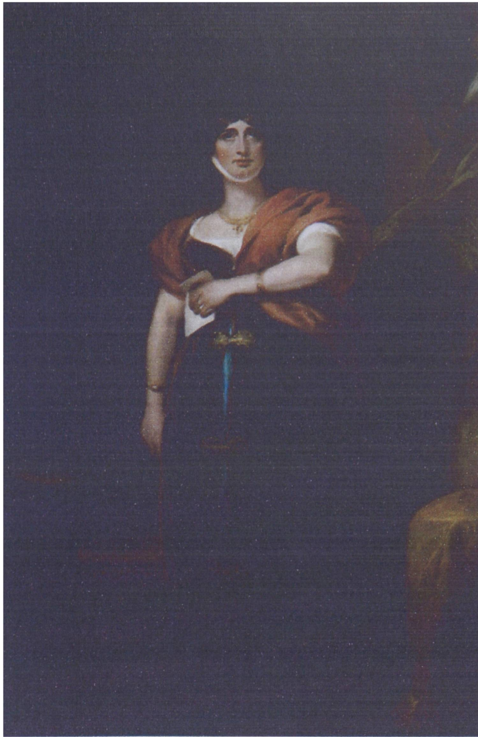
10. Sarah Siddons as Lady Macbeth (Letter scene).