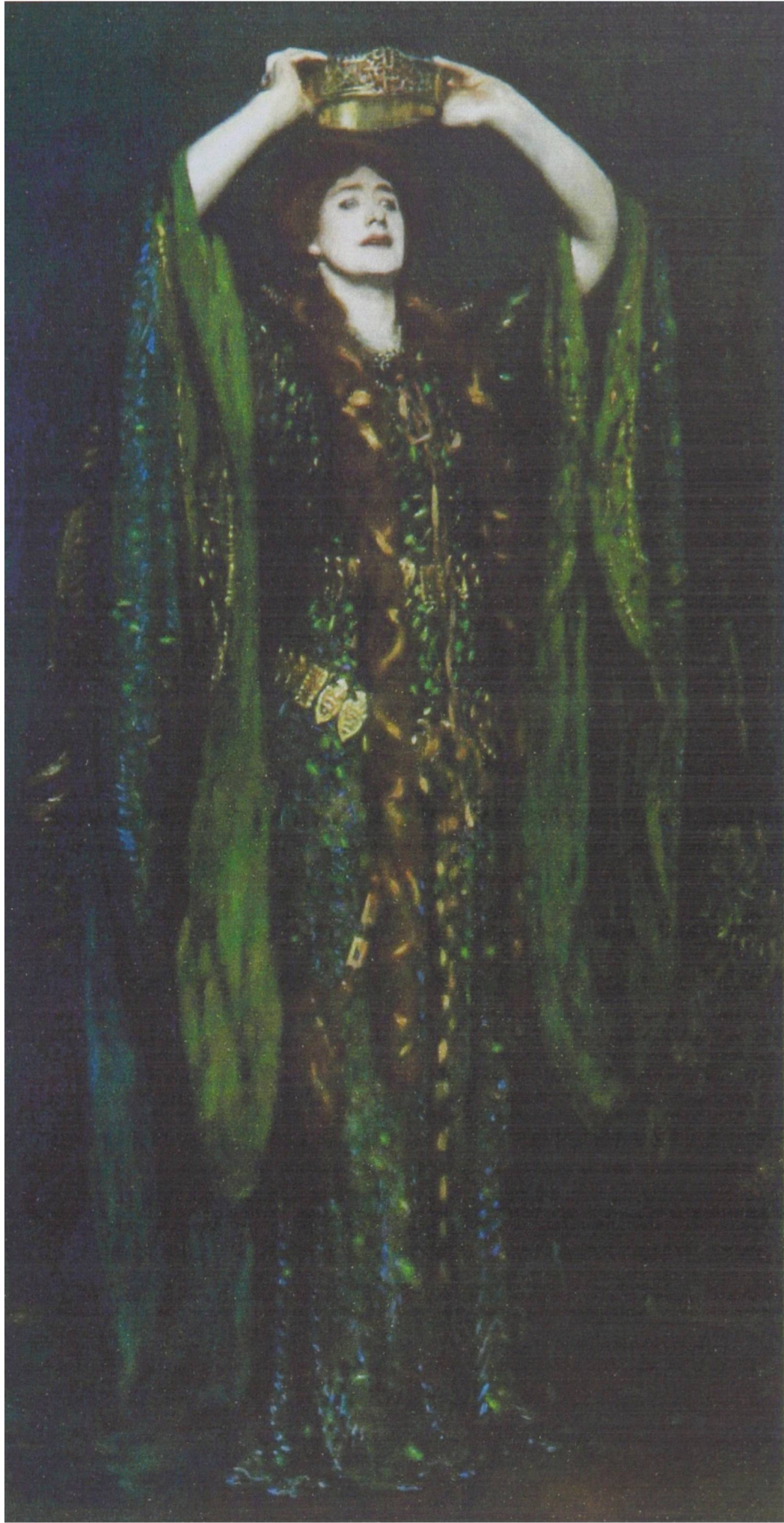
12. Ellen Terry as Lady Macbeth.