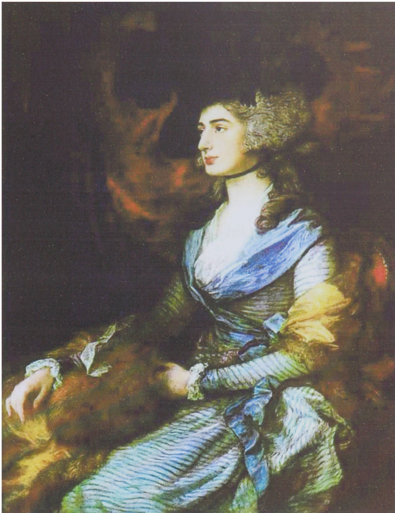
5. Sarah Siddons.