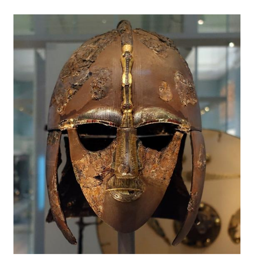
Sutton Hoo helmet<sup>149</sup> (2014)

helmet, the second is an aerial view of a dragon in flight which is formed by the facial features of the helmet.<sup>148</sup>