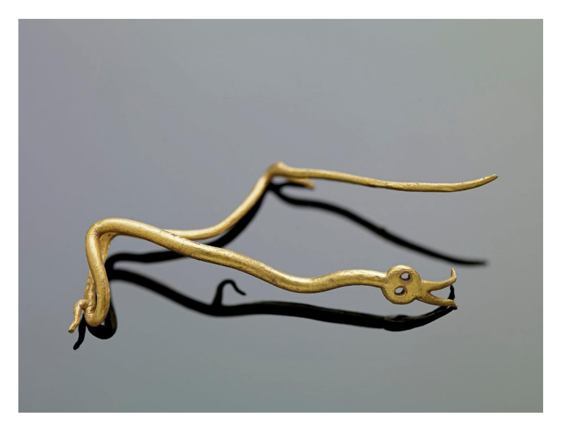
Figure X: A Snake from the Staffordshire Hoard. <sup>4</sup>

This thesis has ongoing implications for studies of early medieval England as the prevalence of wyrm imagery in both literary texts and archaeological artefacts can be considered within the context of the wider wyrm category and its meaning, rather than being viewed in isolation. Indeed, the decorative golden snakes which were found as part of the Staffordshire Hoard exemplify how my research may influence future research. The purpose of the snakes is unclear and, due to their fragility, particularly when viewed in the context of the other items in the hoard which are mostly intended for war, they must have a purely decorative role. With the ideas presented in this thesis, the snakes' purpose can be understood as part of the wider symbolic context of wyrmas , leading to an understanding of them as symbols of wisdom, fear, and the hope of resurrection in the face of death. Furthermore, this thesis has demonstrated the benefits of studying early medieval English material using interdisciplinary