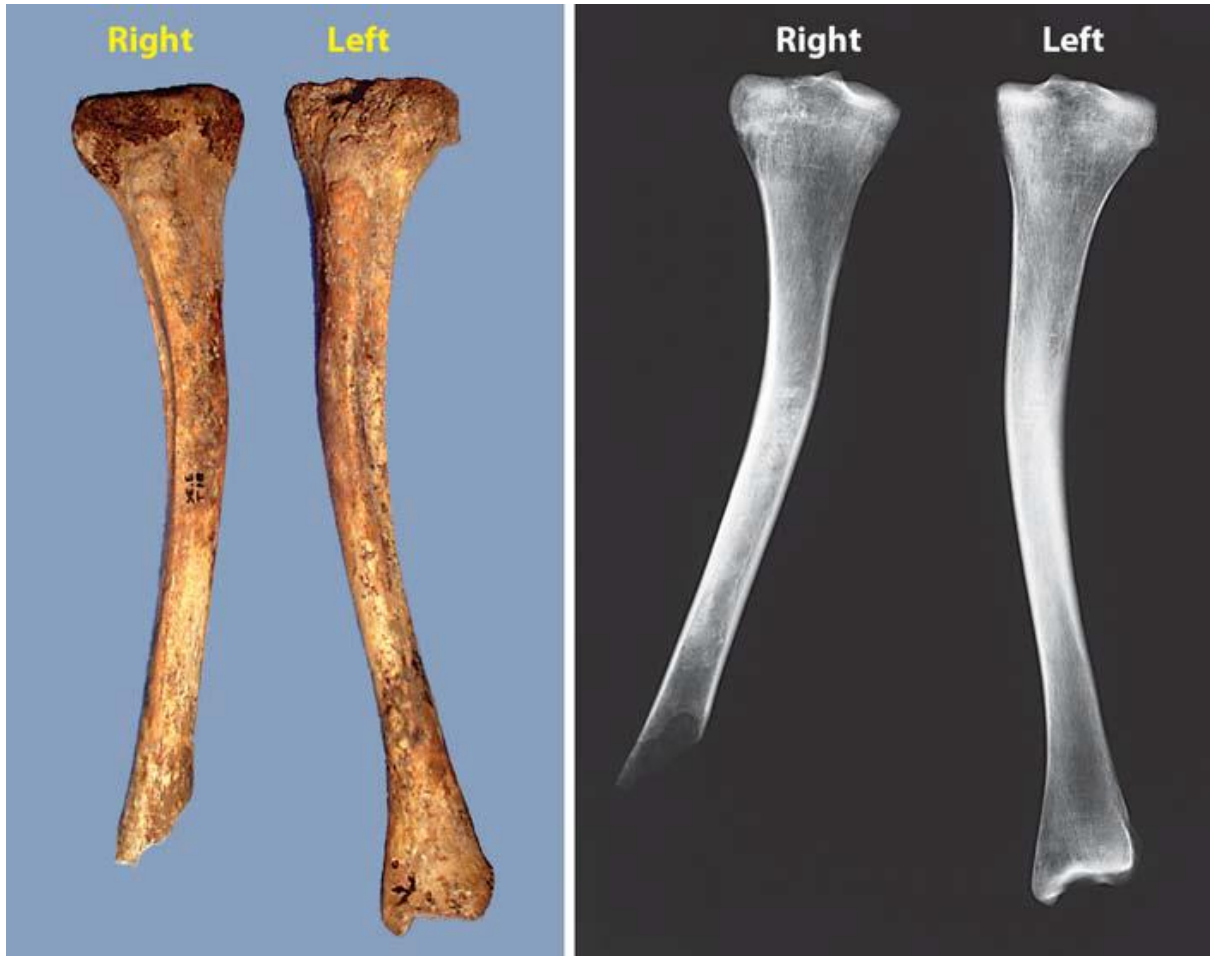
Figure 3.2 Tibial deformities in a Roman skeleton

Macroscopic and radiographic views of the tibiae of a woman aged 27-37 years from the first to third century AD necropolis at Collatina situated fifteen km from the centre of Rome. These show typical bowing due to childhood rickets. Spinal, mandibular and femoral abnormalities were also present. From Minozzi et al. 2012. Palaeopathology in the Roman Imperial Age. Pathobiology 79: 269, 277.