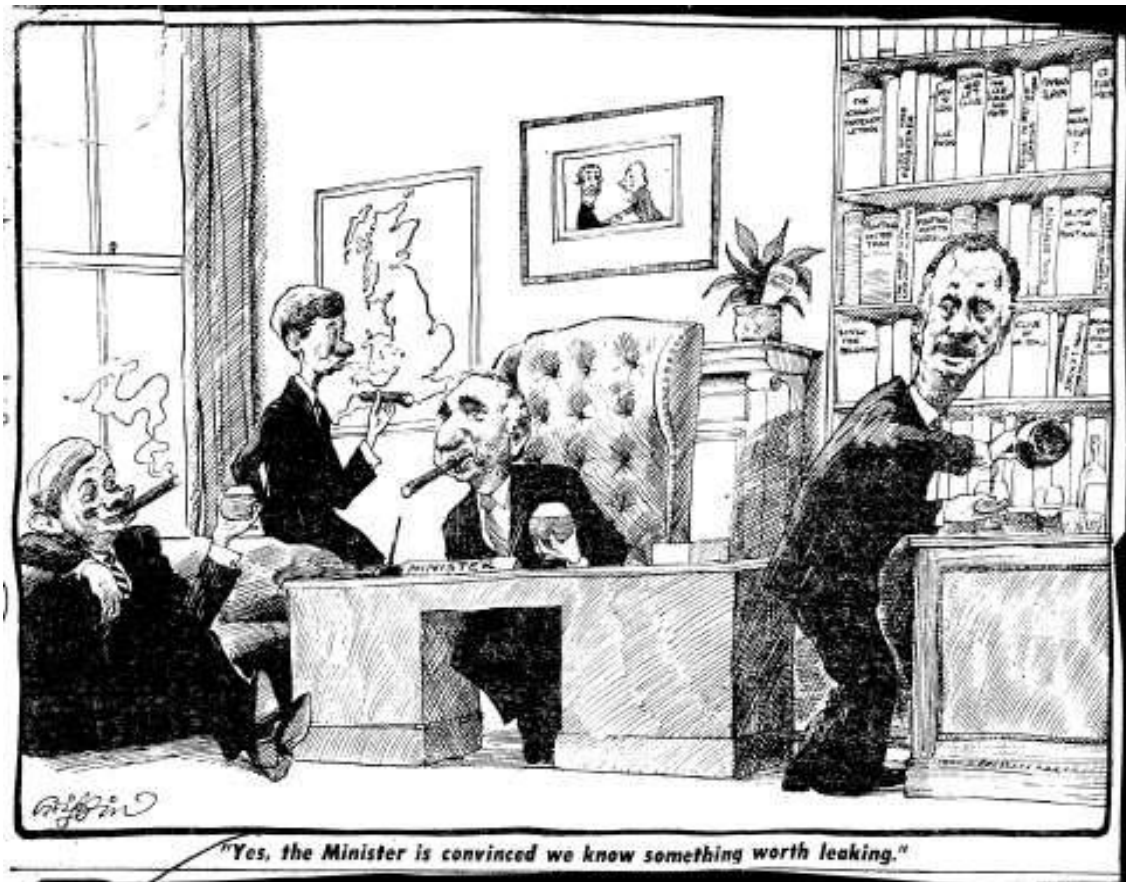
Illustration 1.2, 'Yes Minister', The People , 17 th February 1985. This The People cartoon highlights the power struggle between the Minister, Jim Hacker and the Mandarin, Sir Humphrey Appleby.