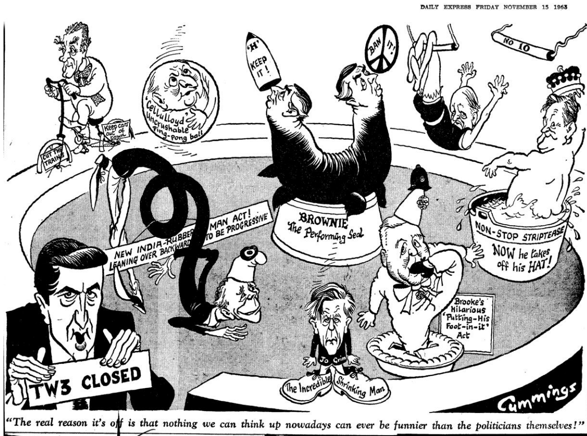
Illustration 1.1, ‘TW3 CLOSED’, Daily Express , 15 th November 1963. This Daily Express cartoon highlights the fact that the majority of politicians that were ridiculed by satirists were Conservative. Furthermore, it highlights the debates surrounding the death of TW3 .

The real difference between That Was The Week That Was and the other products of the satire boom was simply that TW3 attracted a much larger and more diverse audience than the others could ever hope for; and what is more, it was produced by the BBC , still a symbol of national dignity despite the new climate of the sixties. As TW3 became more successful, so it became more daring, and therefore more controversial. 94