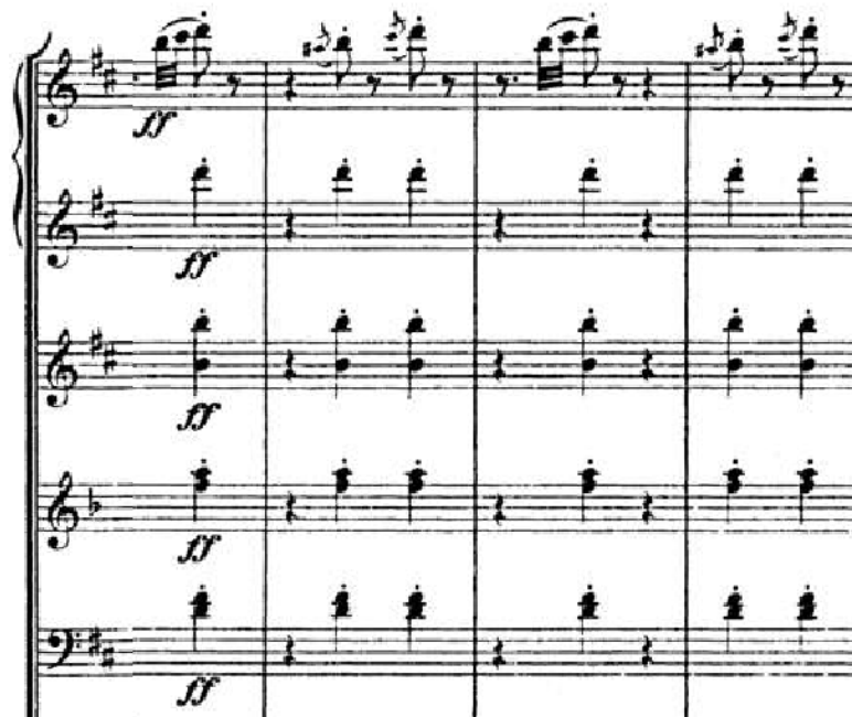
Ex. 13: Liszt, Hamlet bb. 294-297.