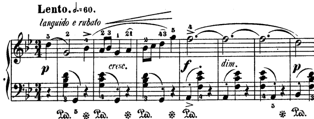
Ex. 3: Chopin, Nocturne Op. 15 No. 3 in G minor bb. 1-7

Liszt's Hamlet resembles Joachim's Overture to Hamlet somewhat more—a piece Liszt he knew well, having conducted it in Weimar in 1854. 57 A sense of anxiety and intensity is common to both, but in the Joachim there is not the passion and drive of Liszt's Hamlet , suggesting that the Hamlet that inspired Liszt differed largely from the popular portrayal that stimulated his contemporaries.