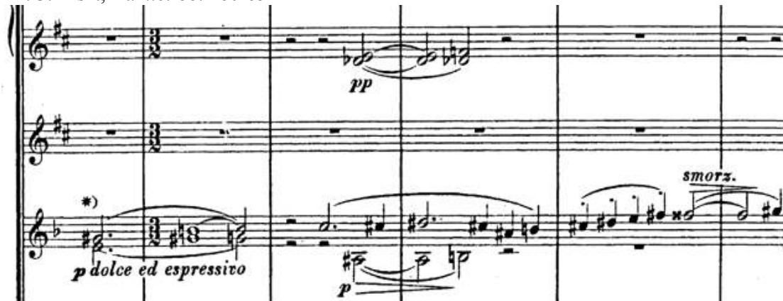
Ex. 5: Liszt, Hamlet bb. 160-65

Ophelia is a weak character here. She is, moreover, soon forgotten as the focus quickly switches back to Hamlet and his plans for vengeance. Furthermore, the autograph score in Weimar shows that the Ophelia section was a late insertion into the piece. 71 Clearly for Liszt, Hamlet was the central figure. Admittedly, at the time Ophelia was often a secondary character, and in fact Gertrude was the lead female role, 72 but Harriet Smithson's portrayal of Ophelia had made her a much more significant part of the play than hitherto. Given his friendship with Smithson and Berlioz, Liszt would certainly have been aware of this. It is yet again, therefore, Dawison's influence that seems the best explanation for Liszt's 'shadowy' Ophelia.