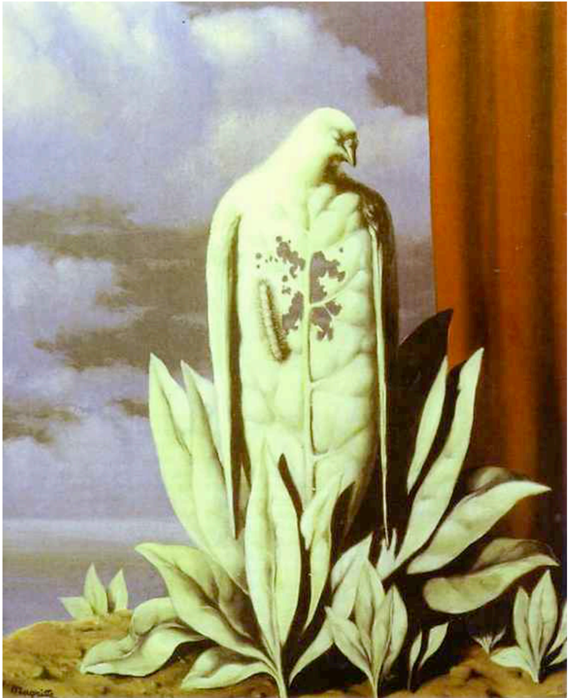
The Flavours of Tears (1948), René Magritte

Oil on canvas (116 x 75cm) Barber Institute of Fine Art, Birmingham.