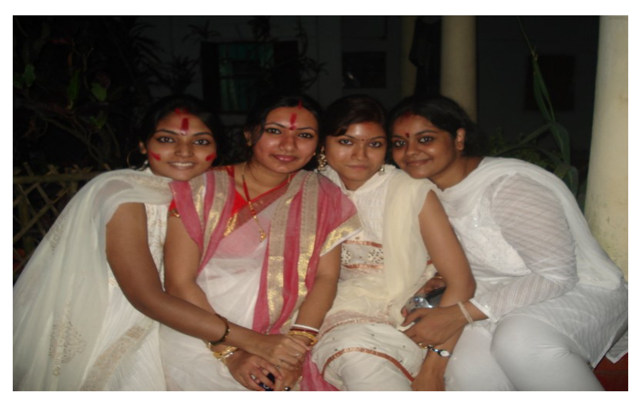
Photo-5: Illustrates the ritual of shnidur khela during the Bengal festival of Durga Puja .

In the photo below, the second woman from the left has recently been married and is shown to bear all the marital signs. The rest of the women in both the photos are unmarried and are engaged in shnidur khela .