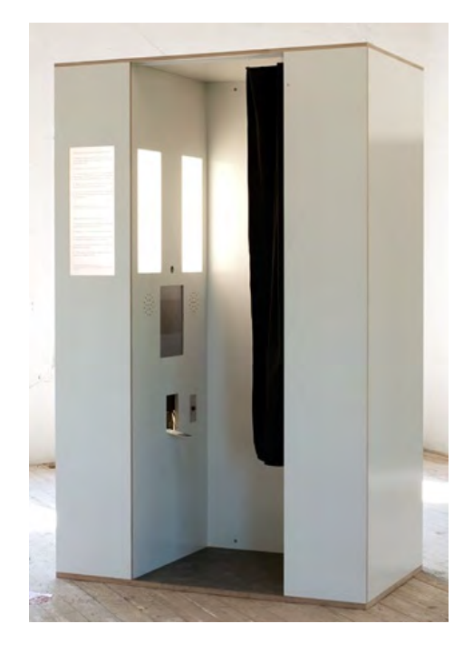
Figure 4. Polyphonic Passport Photo

The Polyphonic Passport Photo is a photo booth that takes your photo, prints your picture, and plays a melody by translating the RGB values of the photo to MIDI notes. It was conceptualised by Reimo Võsa-Tangsoo, an Estonian photographer. He wanted to create an interactive installation where the digital information of a person's face could be listened to. It is a comment on our information age where the details of a human being are readily quantified as collections of numerical data. He asks, "Does a photo tell the story of a person? What happens when you translate that image into another kind of data? Is it still an accurate depiction of them?"