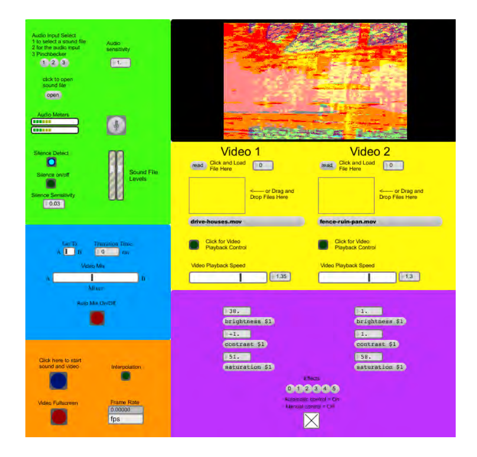
Figure 2. The VideoMasher VJ software interface.

The VideoMasher allows me to mix and manipulate video live while I am creating sound in the Pinchbecker . I approach the creation of live video in a similar way to that of live sound by recording video clips of compelling images and mixing and processing them into an improvised Live Cinema performance. I created several performances using this software during my PhD research period of which Cell is discussed as part of my submitted PhD Portfolio.