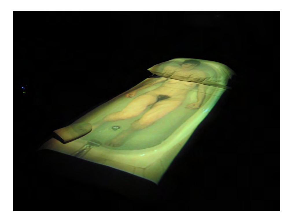
Figure 6. The Bather

The Bather hardware consisted of two piezo transducers imbedded in a foam mattress connected to the microphone inputs of an audio interface. The touch of the participant is transmitted through the foam to the piezos as vibrations. A threshold point is set in the Max patch to trigger sounds and a video file. The video starts at a "home" position with Hood lying in the bathtub. When triggered, a new video is crossfaded with the "home" position video. The figure in the new video, either Hood or Driedzic, carries out a choreographed movement in the tub and, once completed, returns to the "home" position. Only one video at a time can be triggered and it plays through until completed. However, up to eight sounds can be triggered if one continues to scrub the video projection on the mattress, creating a collage of randomly triggered bathtub sounds. These sounds play until they end. The choreographed tub movements consist of a collection of twenty-one videos that have the two figures making