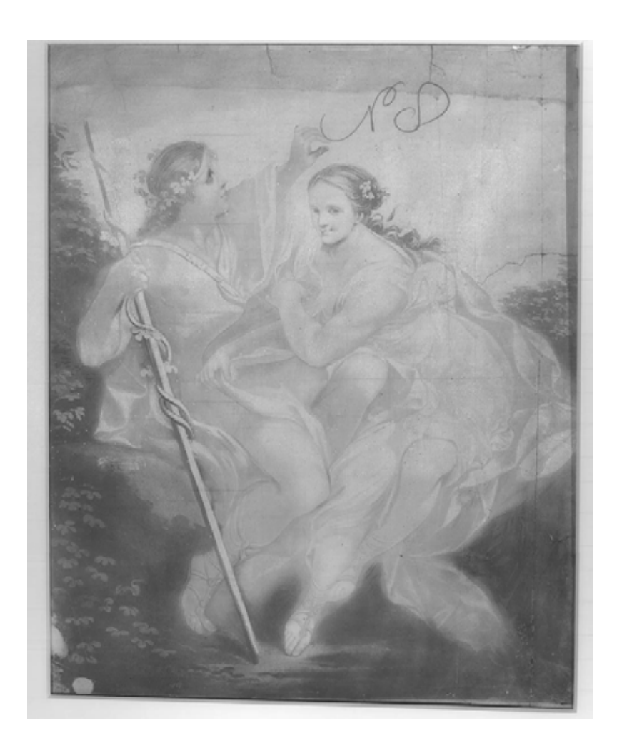
Figure 3b Infrared reflectogram of Venus and Adonis, 2009, London, British Museum