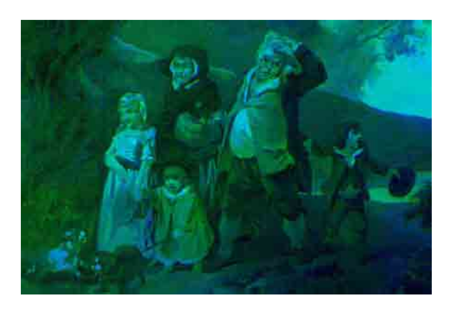
Overlay of both images