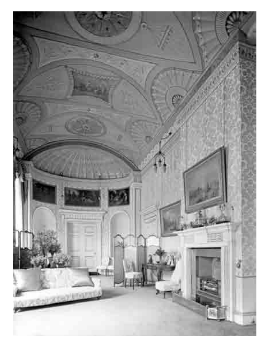
Figure 5 The Gallery, Montagu House, Portman Square [now demolished], photographed 1894, Country Life Picture Library (Courtesy Country Life Picture Gallery, 672261)