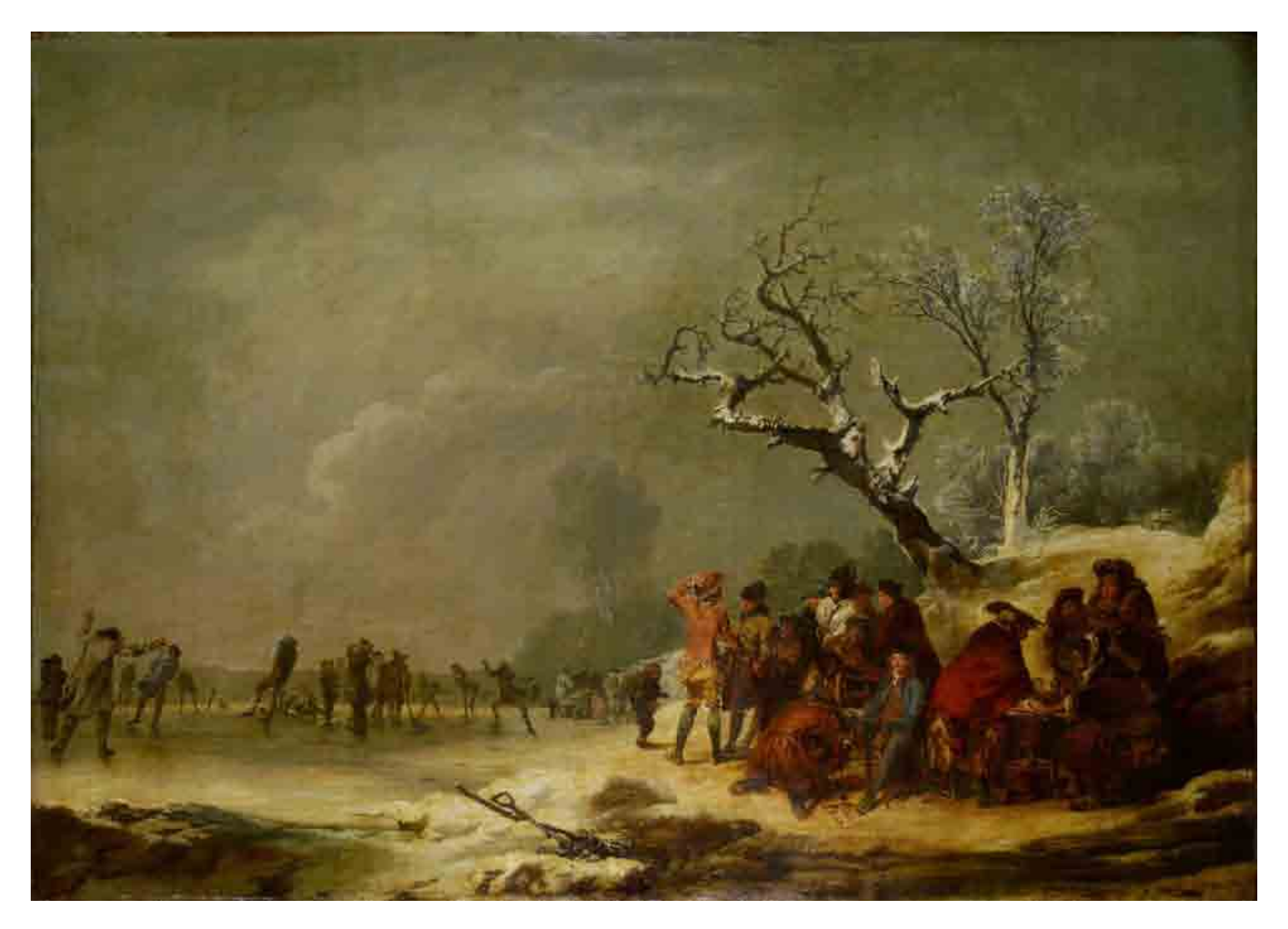
Figure 7 Copy after P J de Loutherbourg, Winter , c1778, catalogued as a mechanical painting, Birmingham Museums and Art Gallery